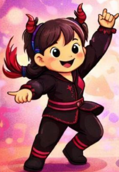
Kpop Demon Hunters