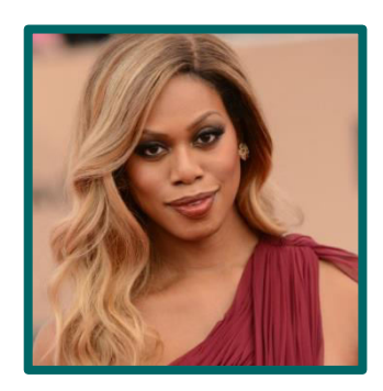
Laverne Cox Actress

People who have used their platforms, status and jobs to advocate for equality and help to increase visibility of LGBT people