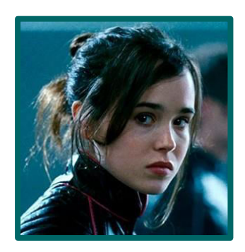
Ellen Page Actress