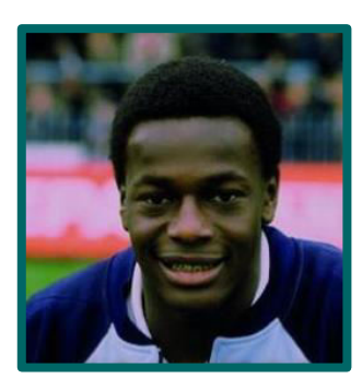
Justin Fashanu Footballer

People who have used their platforms, status and jobs to advocate for equality and help to increase visibility of LGBT people