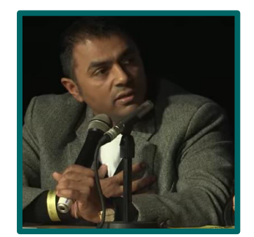
Lord Waheed Alli Politician