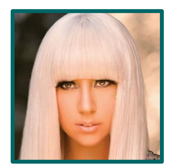
Lady Gaga Singer